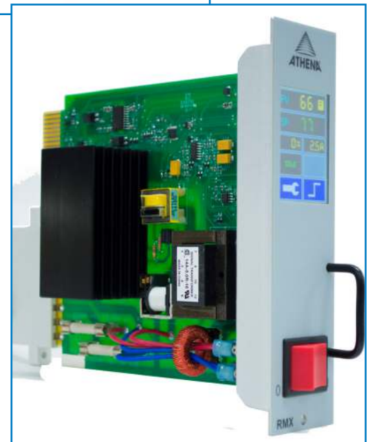
Fig 1. RMX Modular Controller showing single zone temperature control from touchscreen.