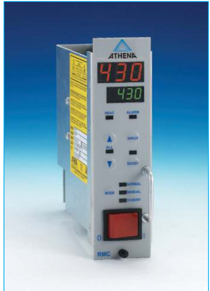
Fig 1. RMC Modular Controller showing single zone temperature control.