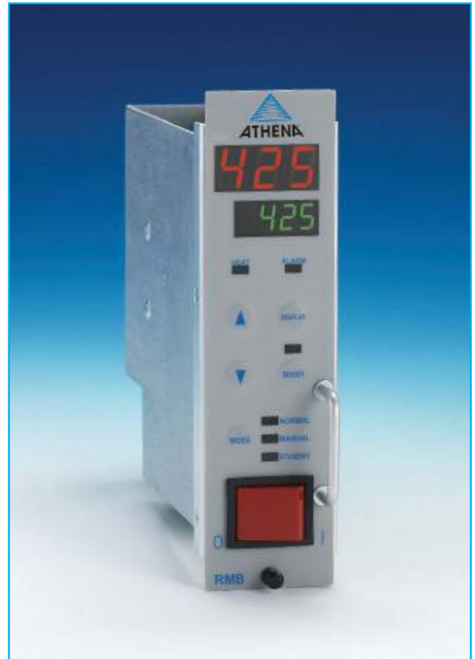
Fig 1. RMB Modular Controller showing single zone temperature control.