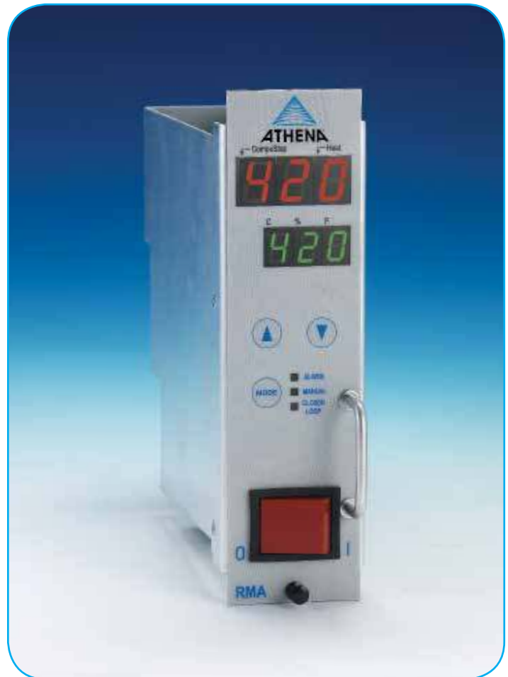
Fig 1. RMA Modular Controller showing single zone temperature control.