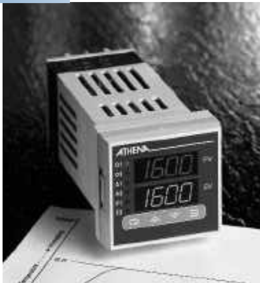
For ordering code and specifications, see page 18.