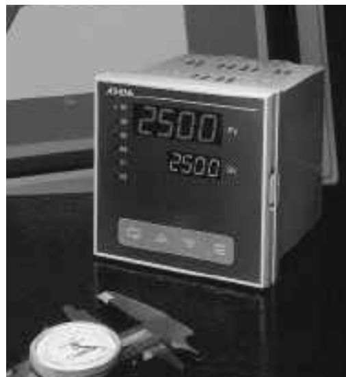
For ordering code and specifications, see page 22.