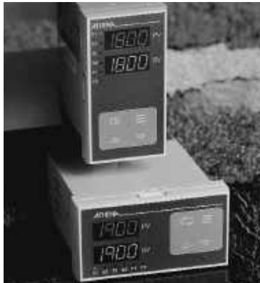
For ordering code and specifications, see page 20.